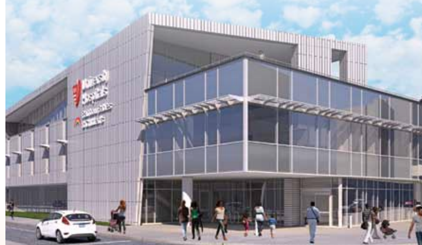
An architectural rendering of the UH Rainbow Center for Women & Children